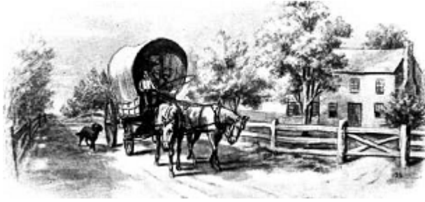
End of the Long Last Mile.