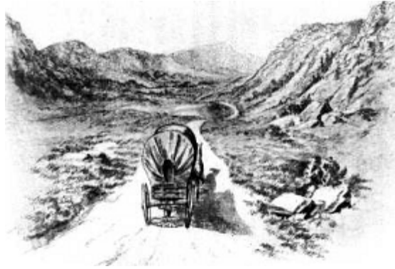
On the Long Trail.