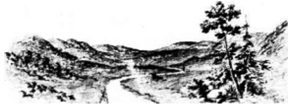
Where the Long Trail Begins